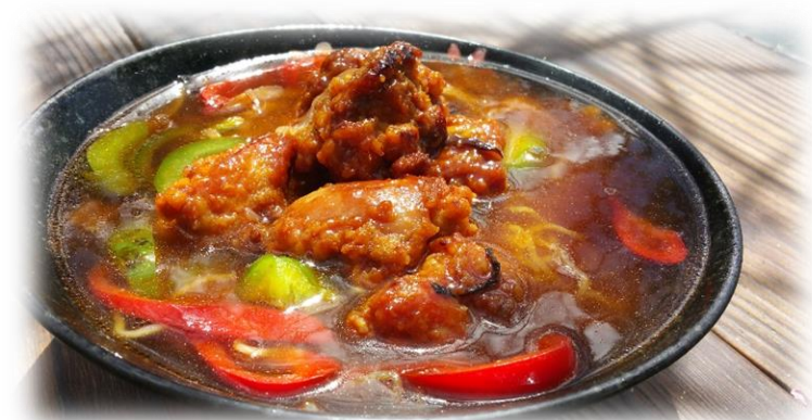
Chicken Kara-Age Ramen