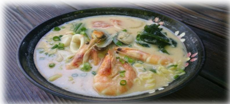
Seafood tonyu ramen